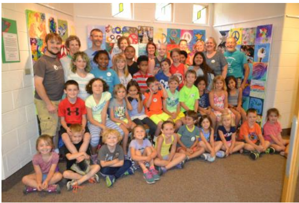
A look back at Peace Camp 2017

At Peace Camp children discover that Peace begins with them!