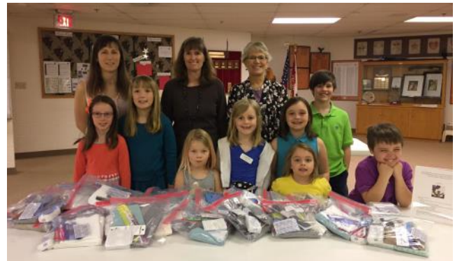
Seeing the needs of others.

With WC offerings and donations from you, we have 29 kits that were then blessed by the children and are ready to send.