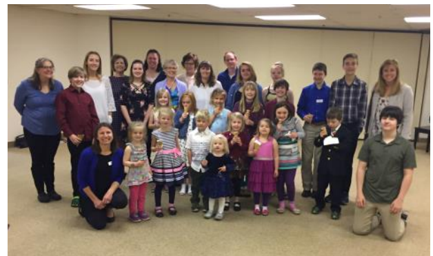
Tasting delight among friends

A day of celebration on May 13 brought Worship Center and Youth together to talk about gratitude. Kids were then invited to share "What am I grateful for at FPC?" on a brick and place it onto the silhouette in the Sanctuary. We then enjoyed ice cream at our year-end celebration.