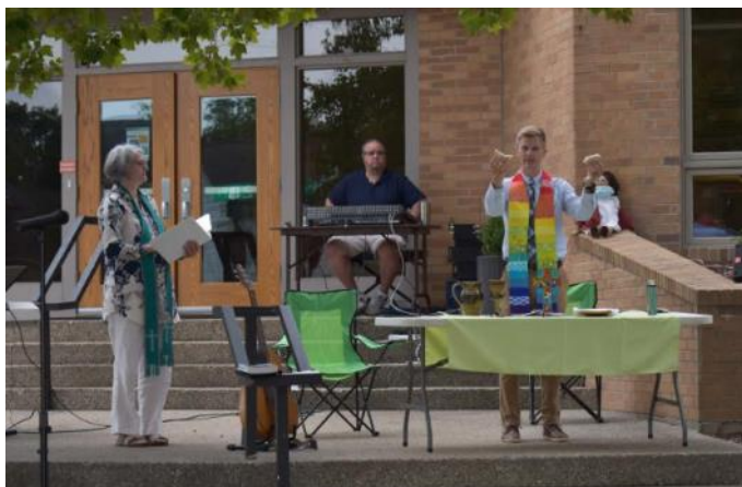
Communion was served.