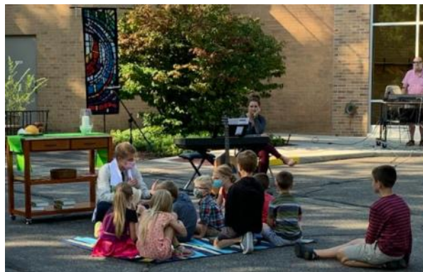
New church stoles unveiled.