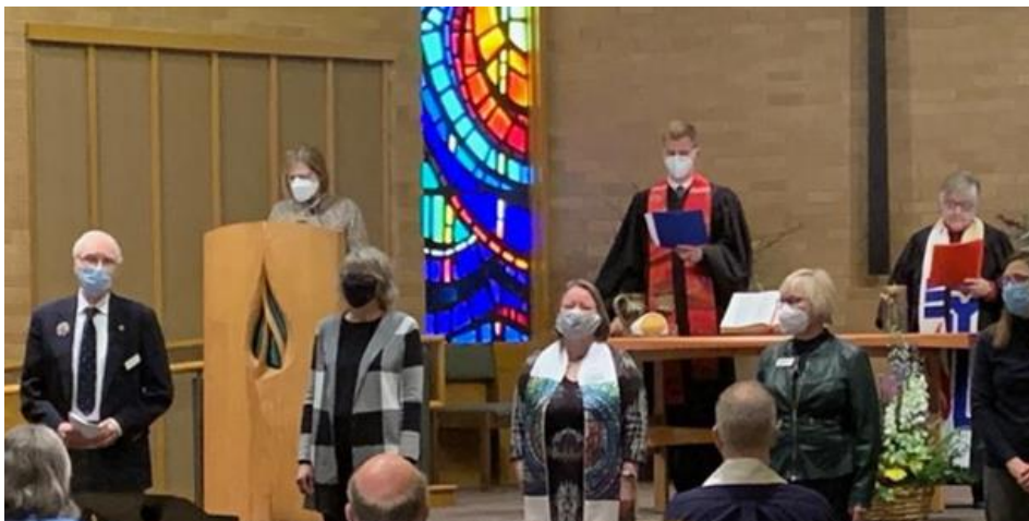
Installation of Elders and Deacons on Sunday, January 30, 2022