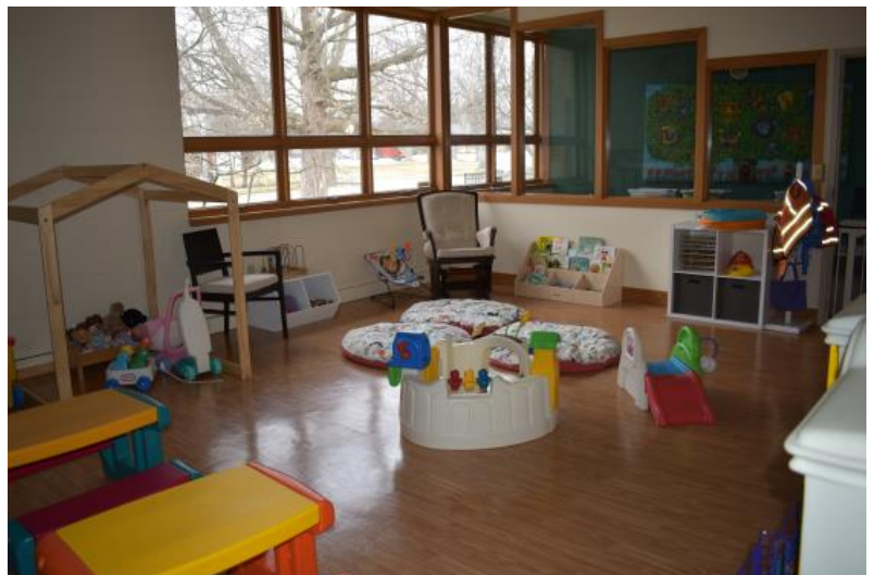
Refreshed nursery space.