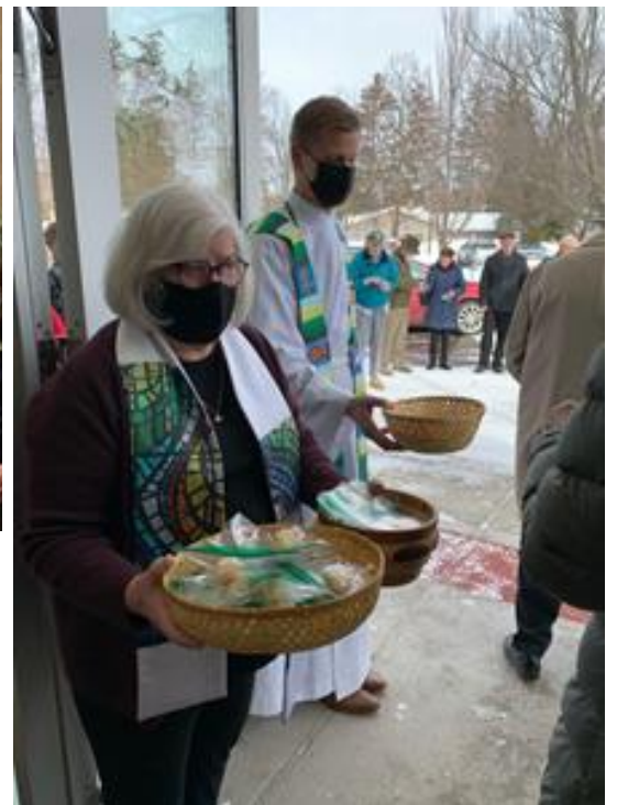
Outdoor Communion on Sunday, February 6, 2022