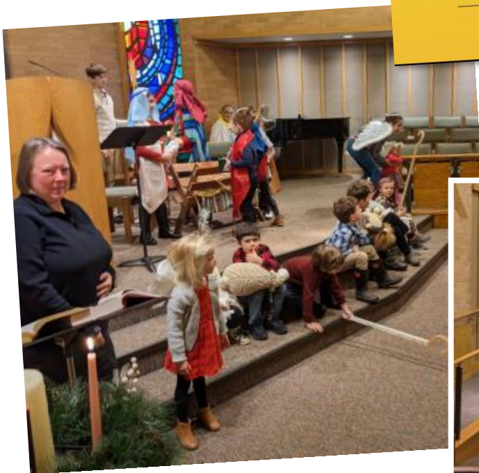
Christmas Eve Pageant featuring children of all ages.