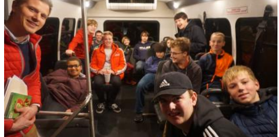
Youth movie night