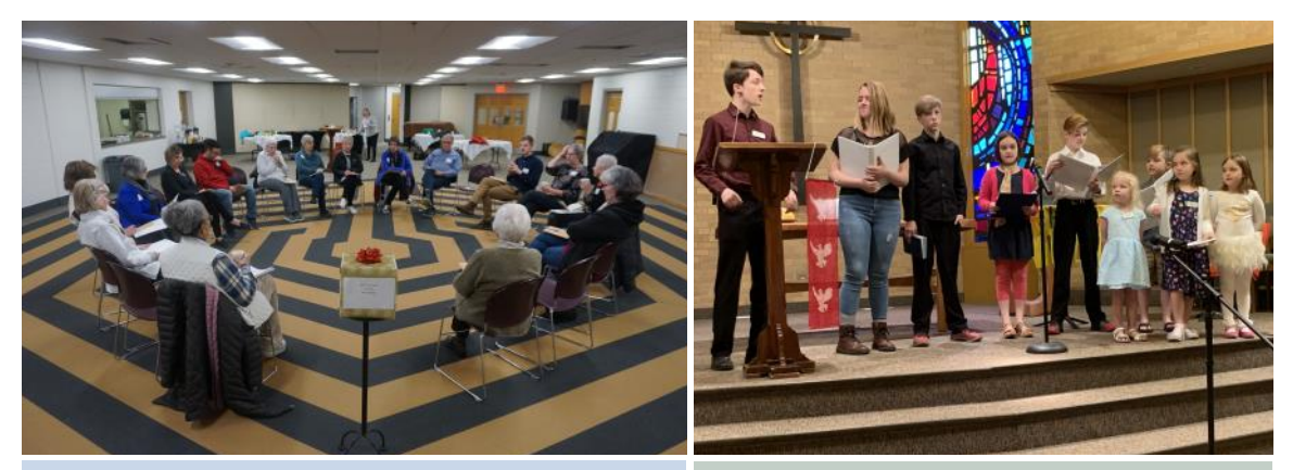
Advent labyrinth event