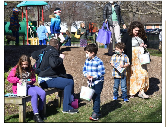
Easter Egg Hunt Shrimp Boil Two photos from Peace Camp Halloween Trunk or Treat