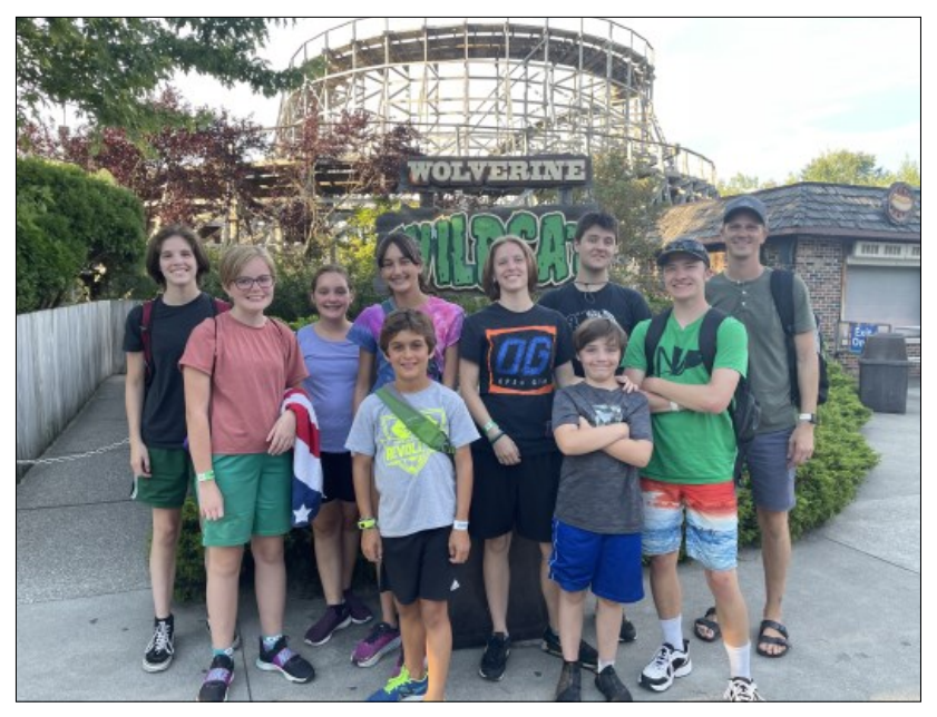
Michigan's Adventure Crew

Cereal Bracket ... Cinnamon Toast Crunch for the win