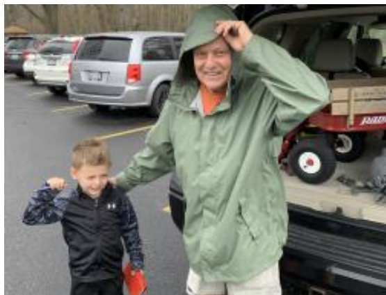
Crop Walk 2022