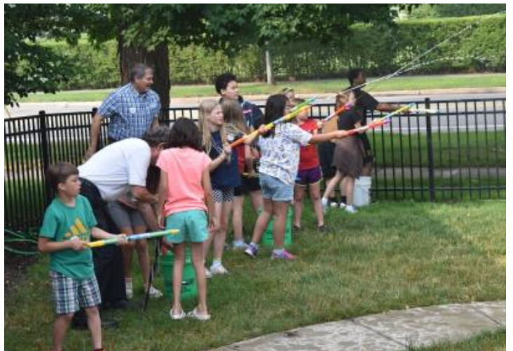
More fun photos on page 8.