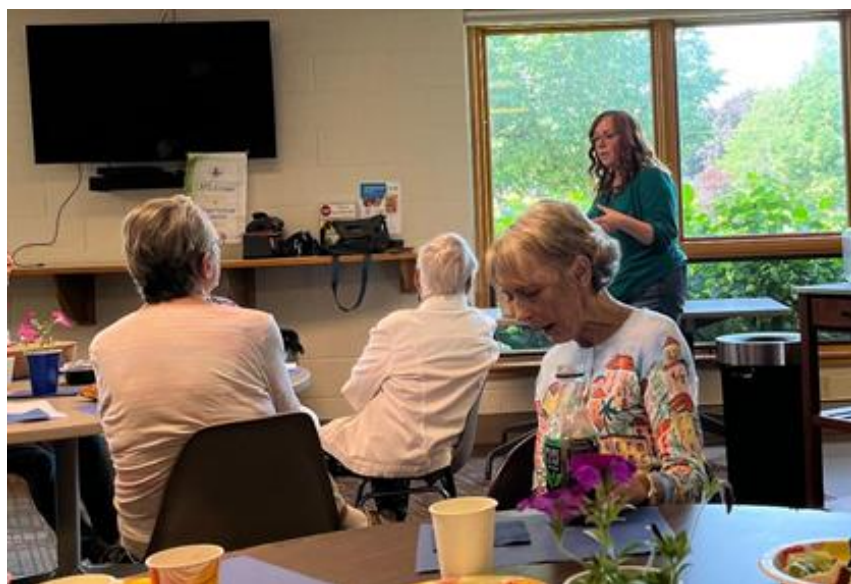
Presbyterian Women Bible study indoor picnic was a hit!

GET THE LATEST NEWS from PRESBYTERIAN WOMEN