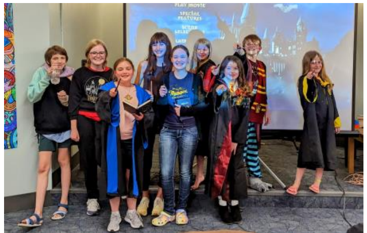
Lots of smiles at Harry Potter movie night!