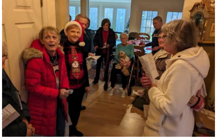
Christmas caroling to homebound members.