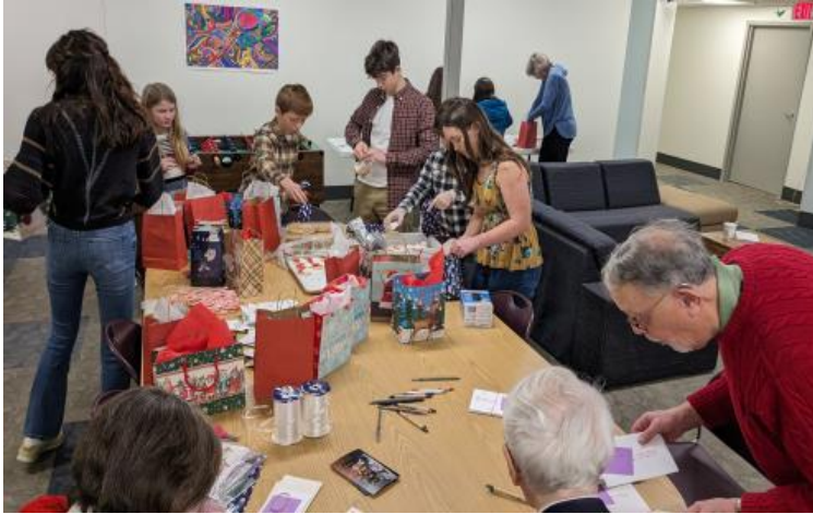
Youth assembling Christmas gift bags for homebound members.