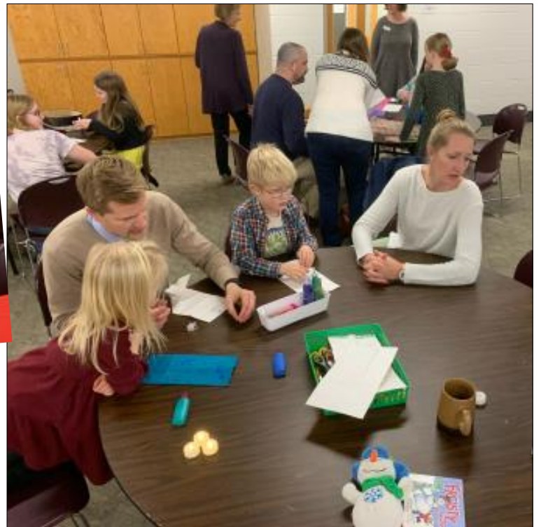
Advent Potluck and Luminaries Intergenerational event. Food was shared and luminaries were made to light our path into the Advent season.