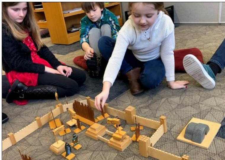
City of Jerusalem