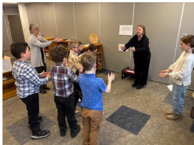
Learning the Doxology