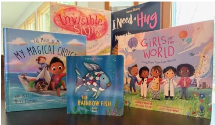
Gift of books