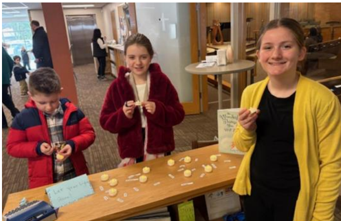
Top: We shine His Light —personalizing candles. Bottom: His Light shines through—creating stained glass.